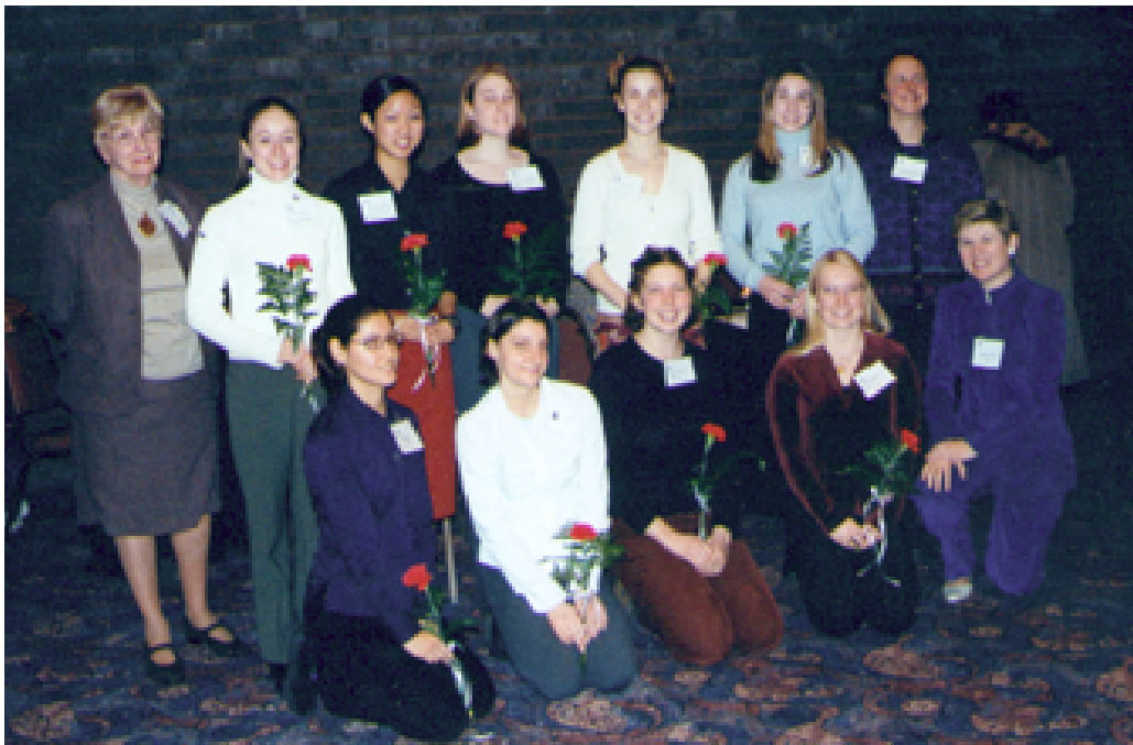
The winners are pictured with members of the Women's Club at the Scholarship Reception.