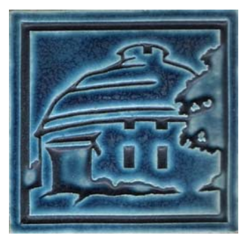
The Round Barn In Matte Finish Blue, Brown, or Oak $35 Each