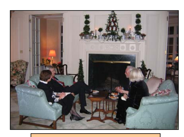
The Whites and the Pettigrews enjoying a chat