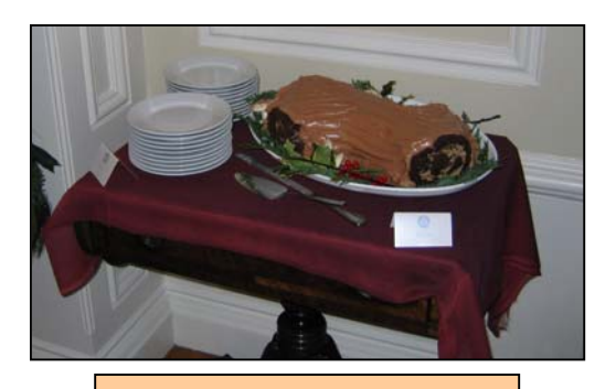
The traditional yule log