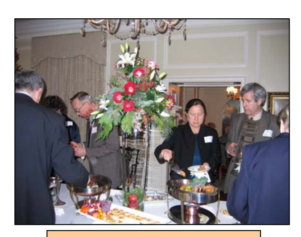
The festive buffet table and 2006 Decade contributors