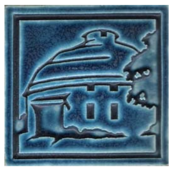
The Round Barn In Matte Finish Blue, Brown, or Oak $35 Each