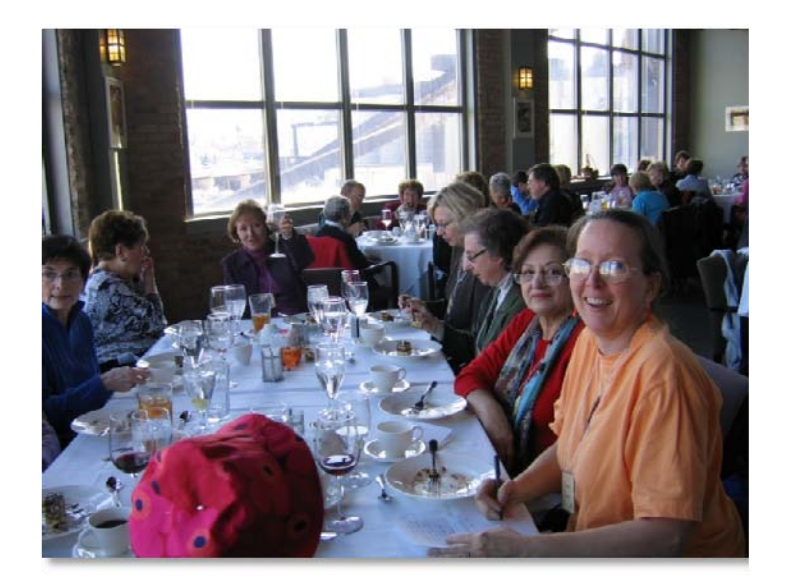
The Fall Tour group enjoys lunch at Kendall College Culinary School.

Our next stop was the exquisite Fox & Obel Market Grocery Store featuring specialty foods from around the world. We then went to Kendall College Culinary School where we were treated to a fabulous lunch and wonderful service. Afterwards, we were then free to explore the Lincoln Park neighborhood for shopping at stores such as Smith and Hawken, Trader Joe's, Whole Foods and Crate and Barrel.