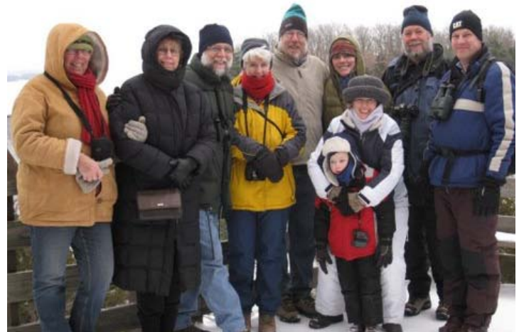
A few of the intrepid members of the Hiking Group who braved 20°F temperatures.

Members of the Hiking Group traveled to Starved Rock State Park in Northern Illinois to eagle watch on January 18<sup>th</sup>. They viewed over 50 eagles during their trip.