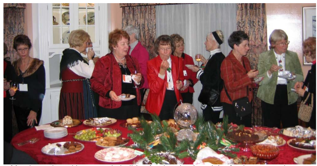
Members shared homemade holiday food and enjoyed the festive atmosphere.