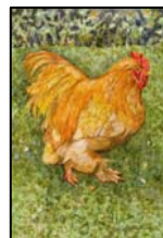
Lord of Chatsworth