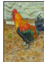
Comte de Burgundy