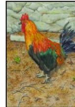
Comte de Burgundy