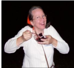
Ice Cream Social

Friday, January 21, 2011 Station Theater & Dessert Date Night 7:45 p.m., Tickets $15.00