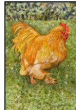
Lord of Chatsworth