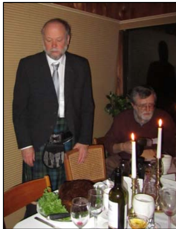
Inspecting the Haggis