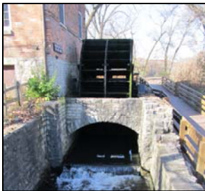
Graue Mill's Waterwheel

Our fabulous fall bus tour contained four wonderful destinations: an educational stop at the historic Graue Mill and Museum in Oak Brook, and shopping stops at the Oak Brook Mall, IKEA, and Trader Joe's. The Graue Mill is the only operating waterwheel gristmill in Illinois, and one of only three authenticated Underground Railroad stations in the state. We were treated to highly informative docents who spoke about frontier life and what it was like for women living in the 19th century. We were also shown how to make wool and linen threads, how to spin, and how to weave. As a result, we're all even more thankful we live in the 21st century! After receiving our gristmill-ground corn meal, we were off to our shopping stops, with all of us doing our best to help the economy. With a picnic dinner on the way home, we were all-satisfied that it was a day well spent.