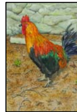
Comte de Burgundy