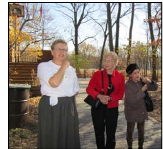
Underground Railroad Stop