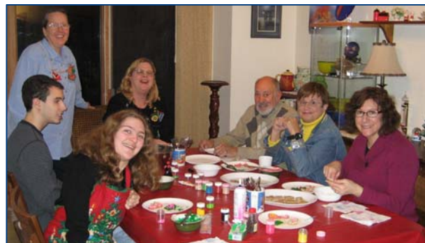
Holiday cookies anyone?