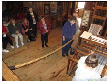
In the Museum – Learning to Weave