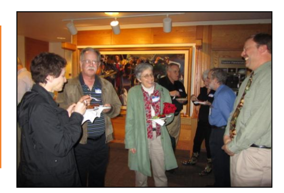
Newcomers, members, and guests enjoyed the wonderful food and company before the screening.