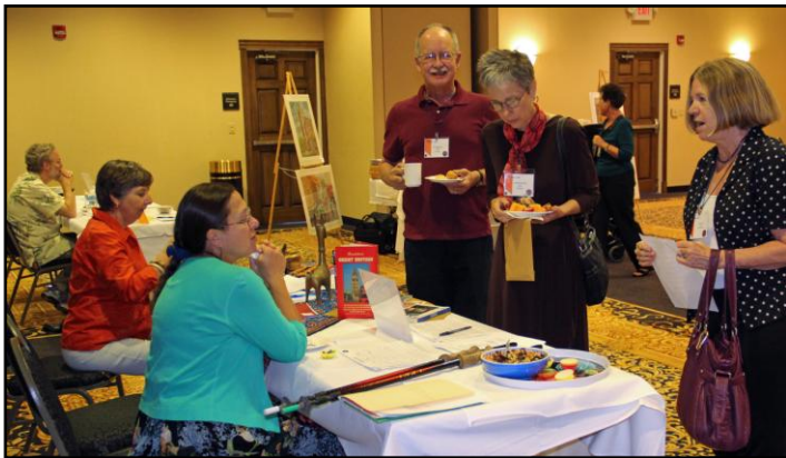
Information about Interest Groups

New this year were representatives from the C-U schools mentoring program and from OLLI, available to answer questions and share information about these two very worthwhile programs in our community. Thanks to all who participated and to all who came for their contributions to make the 2012 Expo a very enjoyable kickoff for our new year. Didn't make it to the Expo? Find contacts and group information on our interest groups webpage.