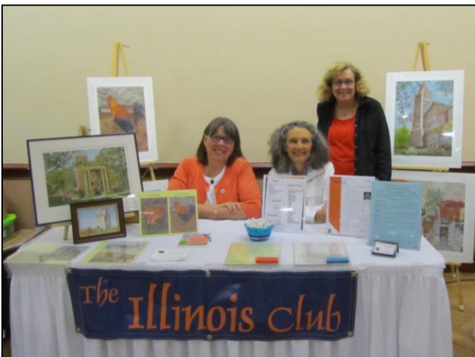
Board members at the U of I All Employee Expo

The Committee recommended that it continue for a second year (approved). The Board will rule on other recommendations including the most important suggestion – that the board provide each new member with a mentor. Many participants in the survey felt that pairing new and established members could encourage members to feel welcome and to remain in the Club. The Committee believes that stronger recruiting will be beneficial, including one-on-one invitations and continuing conversations within the University and general communities by all members of the Club.