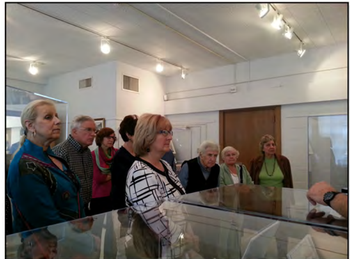
Tour of the Sousa Archive on April 17